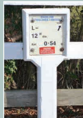
Mainline marker post