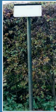
Wingas aerial marker