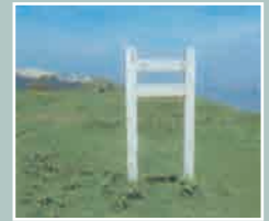
Stile warning marker

Sometimes metal studs are used in roads and pathways