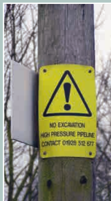
Pole warning marker