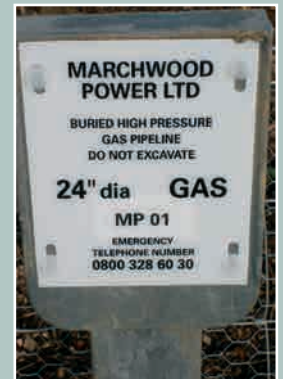
Marchwood Power post