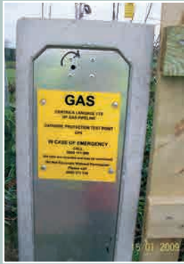
Centrica marker post