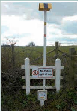
CLH marker post