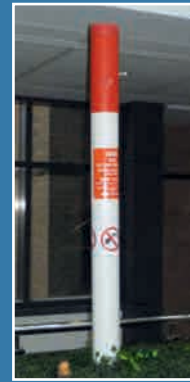
National Grid Gas

Each operator has similar aerial markers to left