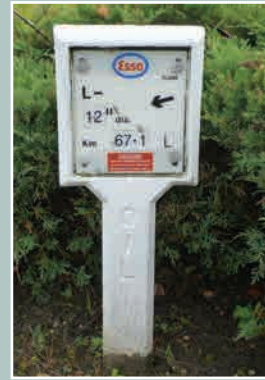
Esso marker posts