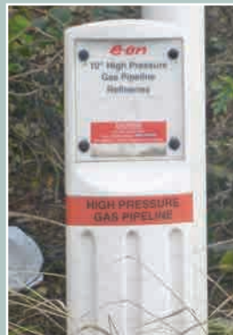
EON marker post