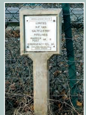
Wingas marker post