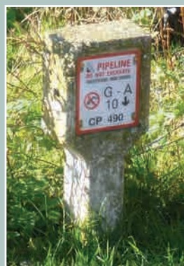
Essar marker post