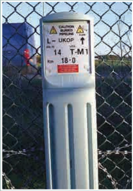
BPA marker post