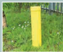
Post warning marker

When the pipeline route has been located it will be marked with location pegs.