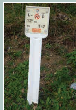
Total marker post