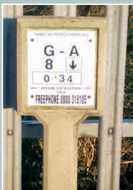
SABIC marker post