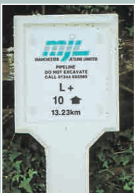
MJL marker post