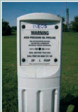
Ineos marker post