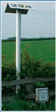
Essar aerial marker